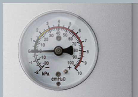
Airway pressure gauge for dual-circuit system

Streamlined Elegance Concealed pipeline arrangement, minimizing exposure and leakage risks