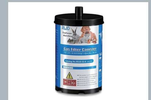
Gas filter canister