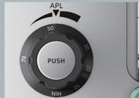
APL valve with scale