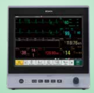
X VET Series Veterinary Monitor